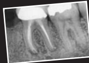
Six Month Review